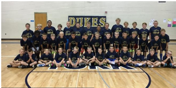
2016 4 th -6 th Campers