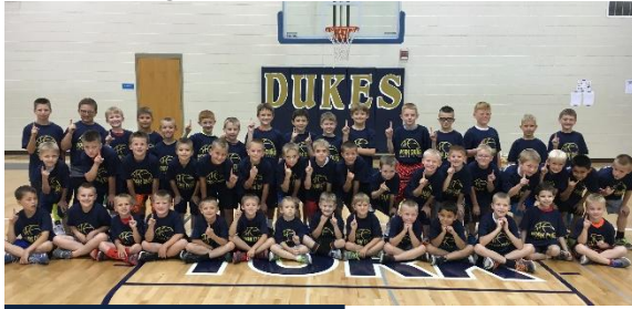
2016 1 st -3 rd Campers