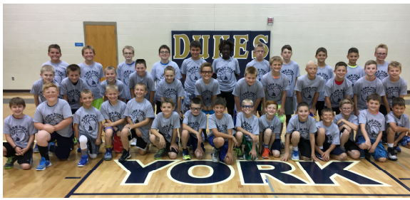
2017 4 th -6 th Campers