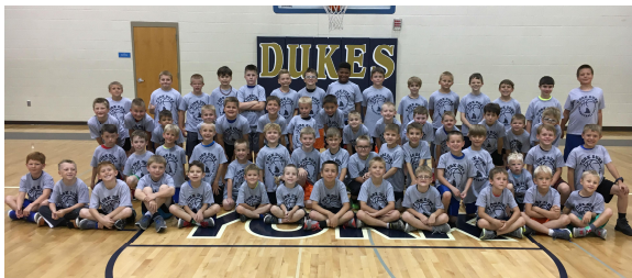
2017 1 st -3 rd Campers